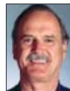
John Cleese "The Importance of Creativity"