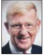
Lou Holtz "Game Plan for Success"