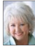
Paula Deen "From Bag Lady to Food Queen"