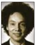
Malcolm Gladwell "The Tipping Point"