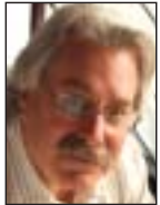
Phil Lempert "Behind the Mask: The Future of Retailing"