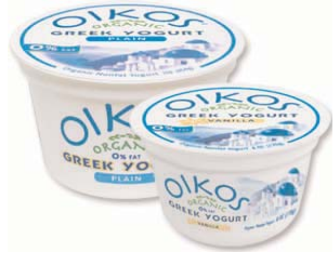
Stonyfield Farms' Oikos. An organic Greek-style yogurt

The yogurt is available in 6-ounce, 16-ounce and 32-ounce sizes. Currently available in grocery and