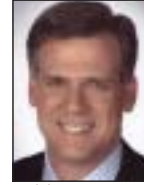
Tony Snow "Election 2008: Fads, Chads, & Choices"