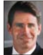
Harold Lloyd "Lead, Follow, or Get Out of the Way"