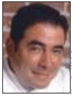
Emeril Lagasse "Bam! The Man and the Magic"